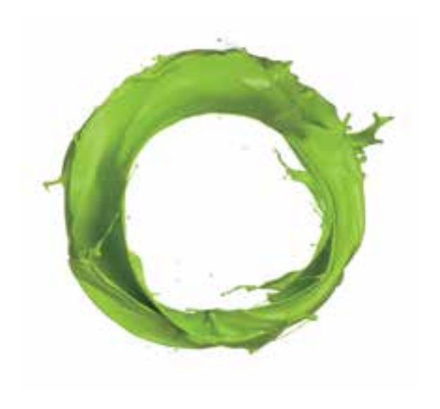
Annual Report 2016

OPUS Group's vision is to be the partner of choice to produce and deliver published content faster and smarter via an integrated full service end-to-end value chain.